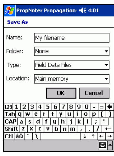
Creating a New Field Data File