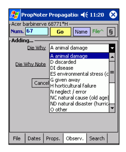
Editing "Die Why" Data

Tap the dropdown list and select the code that describes the cause. The displayed codes have been exported from BG-BASE.