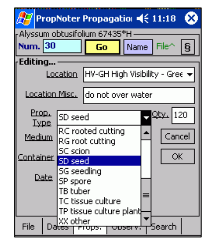
Editing Propagule Data

• Enter the quantity of plants being propagated.