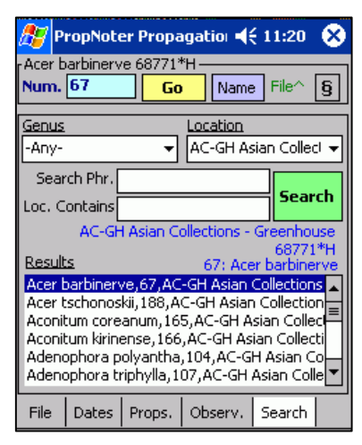
The "Search" Tab

To search for all propagations in a single Location, select the Location from the drop down list. Make certain that "Any" appears in the genus box and that the "Search Phr." and "Loc. Contains" lines are empty. Then tap the "Search" button. The results will appear in the box below, listing the plant name, location, and accession number. To open the record for one of these propagations double tap it.