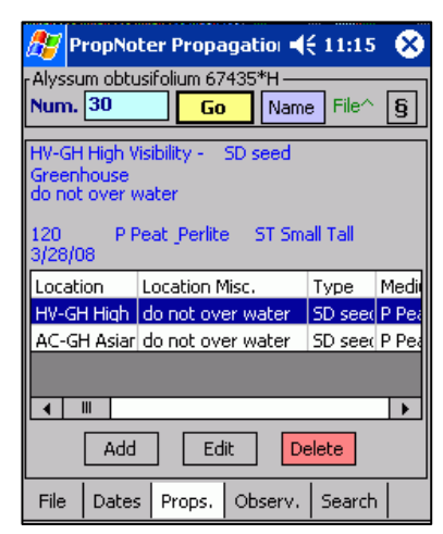
The "Propagules" Tab

Tap the dropdown list and select a location for this material. The displayed location codes have been exported from BG-BASE.