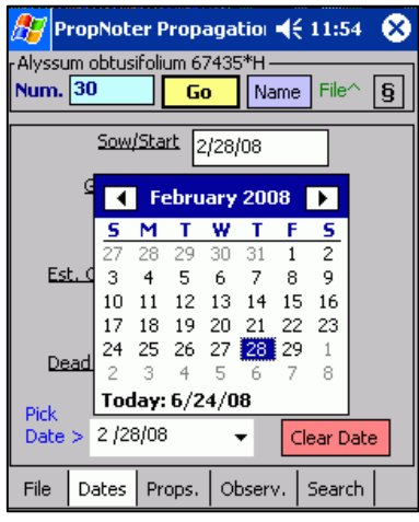
Selecting a Date